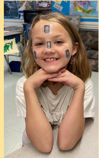
Terry Fox Run was a success

Was great to see everyone at the Pancake Breakfast.