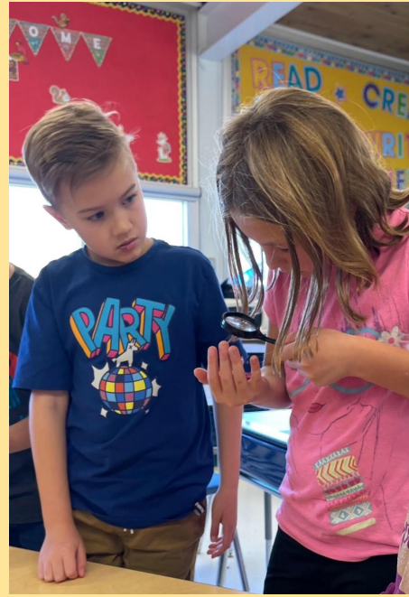
Grade 3&4 grew crystals!